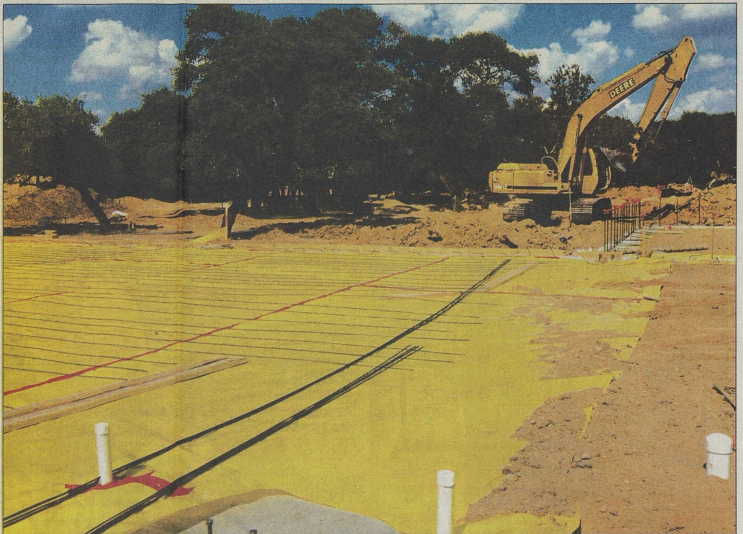
Crews are preparing to pour the slab at the new junior high facility in Altair.